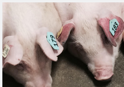
Figure 2: Refer to images as figures.

Submission due date is November 12, 2021